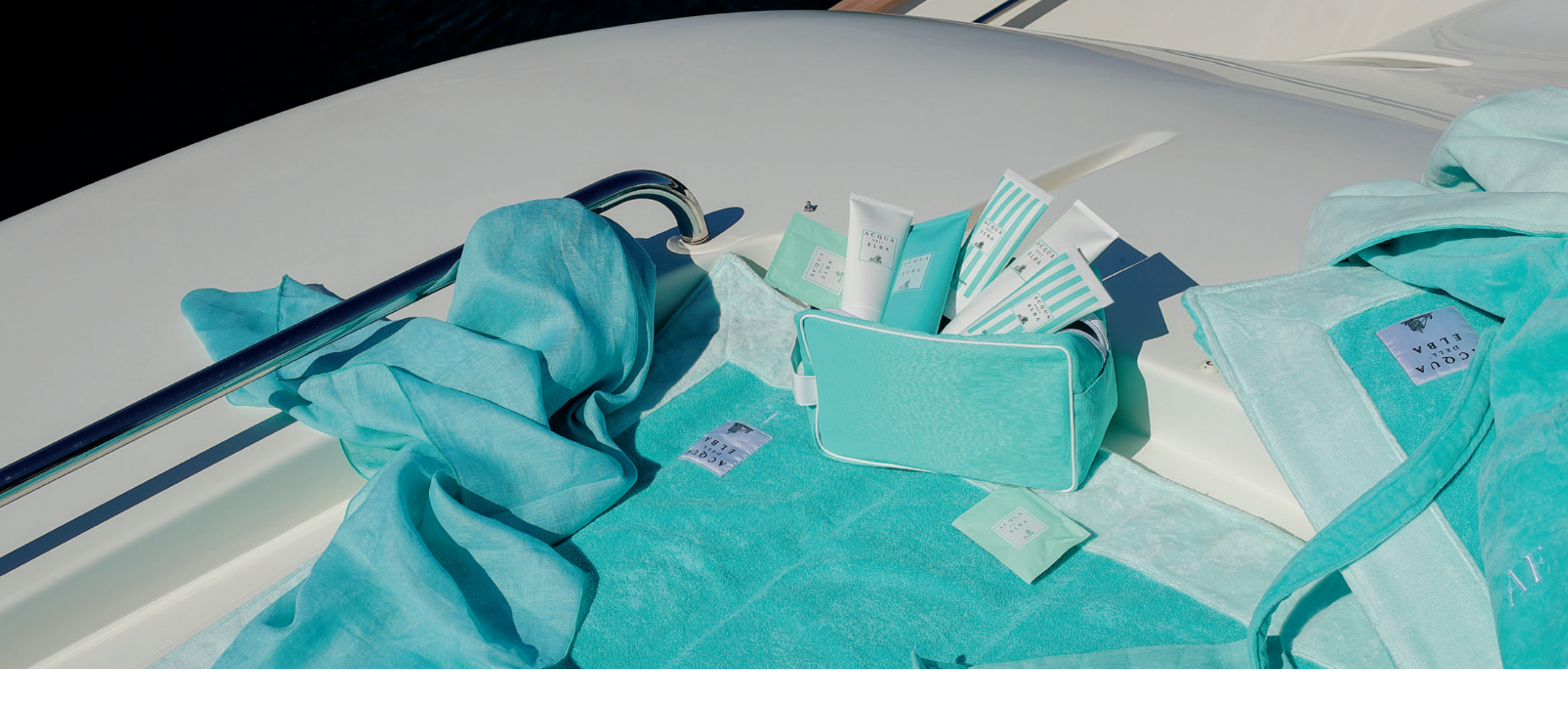
Health & Beauty Yachting Set