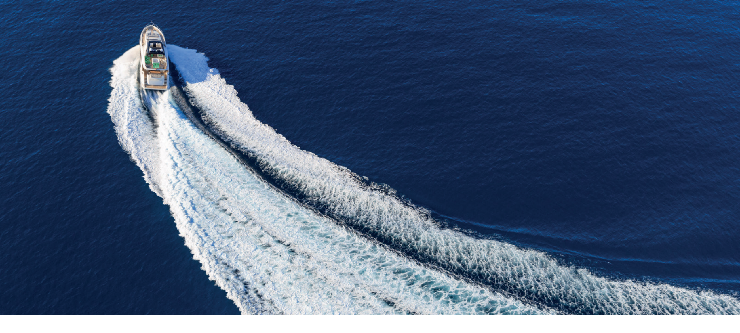
Yachting Home Diffusers