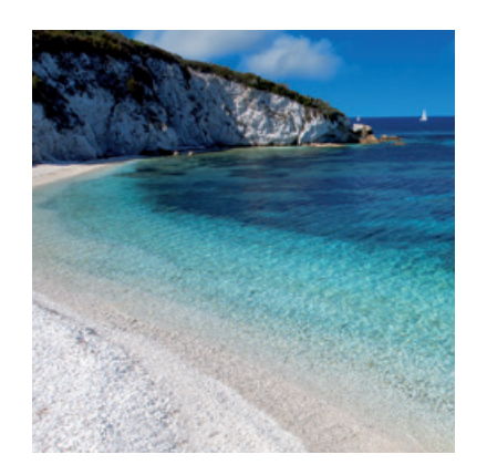
Acqua dell'Elba Handmade Manufacture of Perfumes Isola d'Elba - Toscana - Italia

Tel. +39 0565 99513 - Fax +39 0565 998075